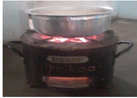
a) Air hole fully open

The result (Plate 2), had it that the frequency of pressure released from CCBB was more than double (27) while that from PC was 12 (Fig. 1). [14] found out that briquettes made up of charcoal dust supply an additional energy of 16% of the cooking fuel.