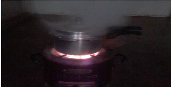
Plate 2. Using pressure release frequency (PRF) technique from a 3L capacity pressure cooker to determine the heating capacity of CCBB.

study since it is heat that initiates the pressure released by the pressure cooker. The PRF of the pressure cooker was determined by comparing the number of pressure released from a jiko filled with PC and the same jiko when filled with CCBB. The time taken between the first and the last pressure releases and their intervals were taken using a stop watch. The study assumed that: the higher the PRF of the heating material, the higher its heating capacity.