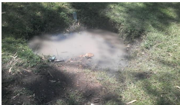
Plate 4: Ditches created as a result of extraction of clay soil for charcoal briquetting causing environmental challenges.

open ditches also make the environment ugly and distort its natural aesthetic value which is a key pillar in tourism attraction and natural therapy. The bareness of the soil (Plate 4) caused by ditching effects accelerate soil erosion.