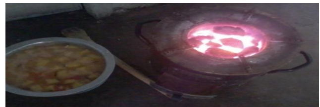
c) Air hole partially opened and sufuria removed Plate 3a, b and c. Flame qualities of clay charcoal briquette.