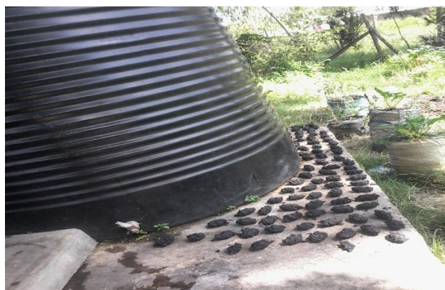
Plate 1. Clay charcoal briquettes drying on a water tank concrete slab.

Heating process: Wet briquettes are aired in the sun to dry. They are laid in lines on polythene sheet, concrete slab (Plate 1) or dry open ground and turned 2-3 times a day depending on the intensity of the insolation for even drying. The briquettes were lined about 5cm apart to reduce shading effects from interfering with the drying process. Direct solar heating was used due to availability of abundant solar energy in Kenya. It takes 2-3 days depending on the availability and intensity of the solar insolation. The use of the free solar energy in the drying process makes the production of charcoal briquettes cheaper and more affordable as compared to use of kiln [15], [14].