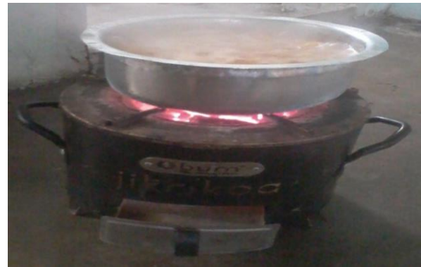
b) Air hole partially open